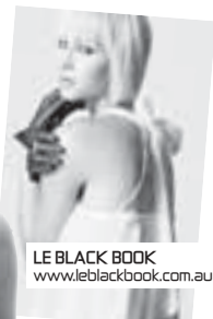
LE BLACK BOOK www.leblackbook.com.au

Contact The Informer on (07) 3397 2760 or chris@ravemagazine.com.au .